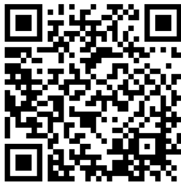
QR scan code for Douglas Sheerer website pages